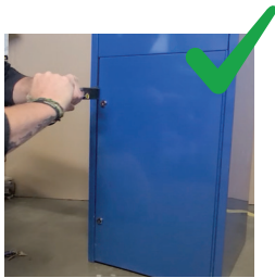
ANTI-PRY DOOR JAMB DOUBLE LOCKS