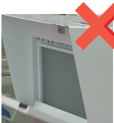
COLLECTED ITEMS ARE EASILY ACCESSIBLE