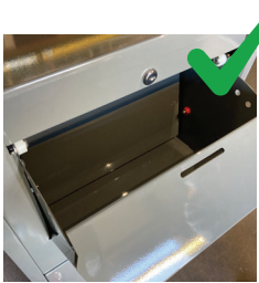
ZERO ACCESS BAFFLE RESTRICTED HOPPER