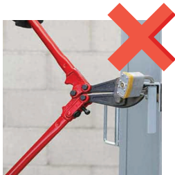
PADLOCKS ARE EASILY CUT OFF